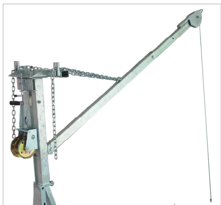
OPTIONAL GRU + PIEDINI / FEET