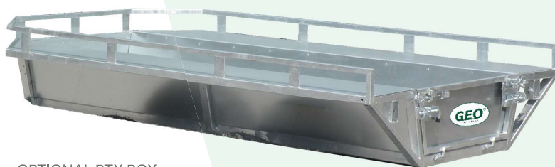
OPTIONAL BTX BOX