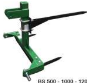
BS 500 - 1000 - 1200